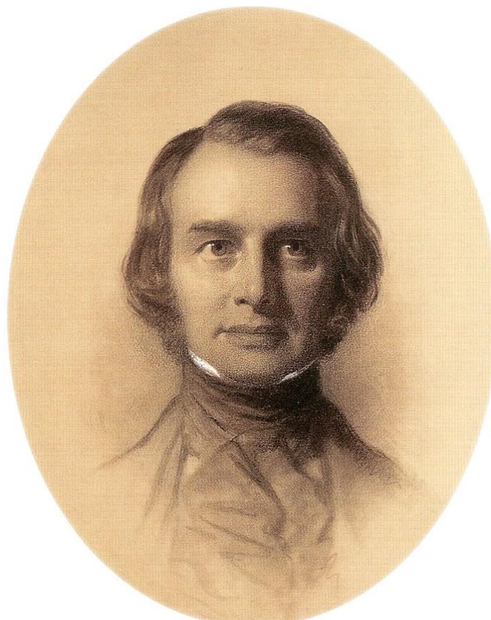
Image 7. Smith Professor Longfellow by Eastman Johnson, 1846. Longfellow House—Washington's Headquarters Museum Collection (LONG 544).