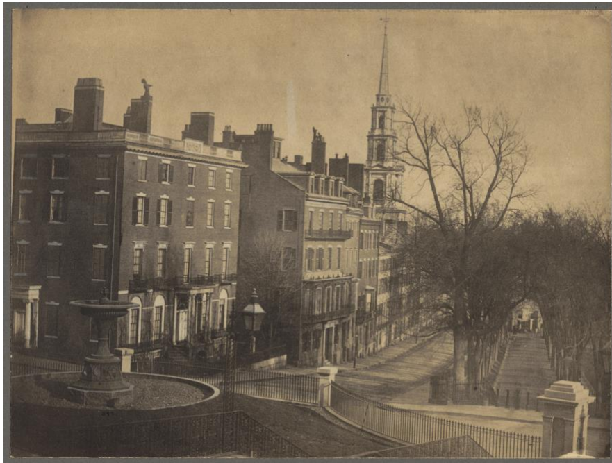
Image 3. George Ticknor’s Beacon Hill house seen from the Massachusetts State House, 1858.