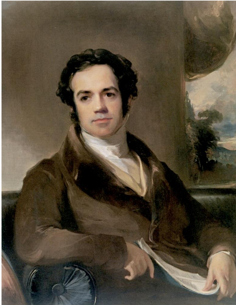
Image 2. Portrait of George Ticknor by Thomas Sully, 1831, during tenure as Smith Professor at Harvard.

Spanish books, always so rare in the great book-marts of the rest of Europe” (Ticknor, 1849, vol. 1, p. v). He began his tenure as Smith Professor in 1819. Six years later, Bowdoin took steps to establish a similar program of its own, emboldened by a bequest from the widow of the college’s first great benefactor, James Bowdoin III, to create a chair for the teaching of Romance languages, “particularly French and Spanish.”