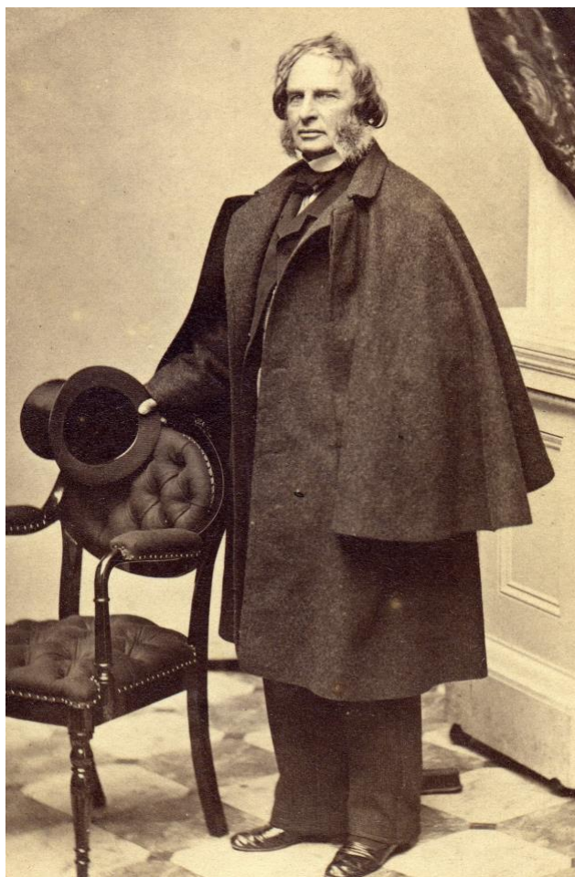
Image 8. Professor Emeritus Longfellow, c. 1858